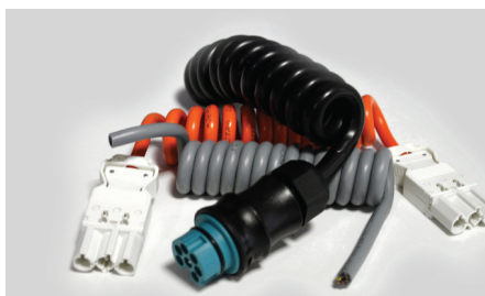
Harnessed spiral cables